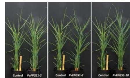
Representative PvFPGS1 -RNAi transgenic and control lines at 3 months old grown in greenhouse